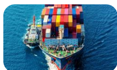
Banking & Asset financing