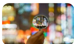
Ethics, Investigation, Defence