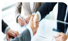
M&A and private equity